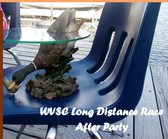
WVSC Long Distance Race After Party