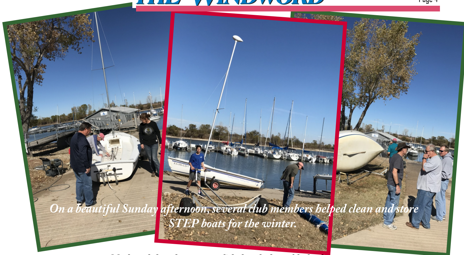
On a beautiful Sunday afternoon, several club members helped clean and store STEP boats for the winter.

Much needed work was accomplished, and a heart felt thanks goes out to the following members for participating: