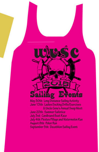
Back only shown