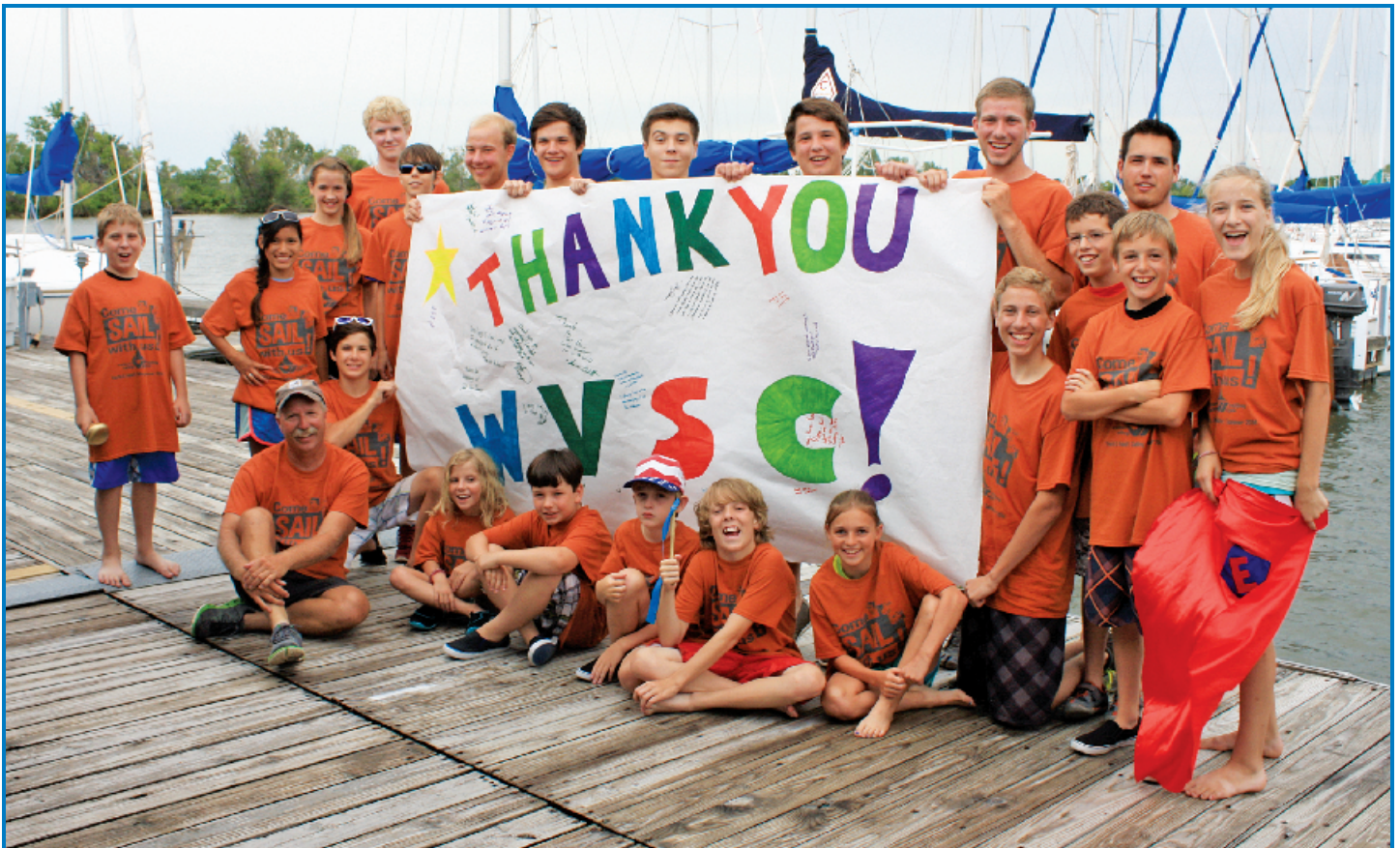
Thanks, Walnut Valley Sailing Club! The STEP Youth and Adult Sailing Programs appreciates all that you do. (The picture represents about a 1/4 of us...Youth 8 -18 years old; First Session.)