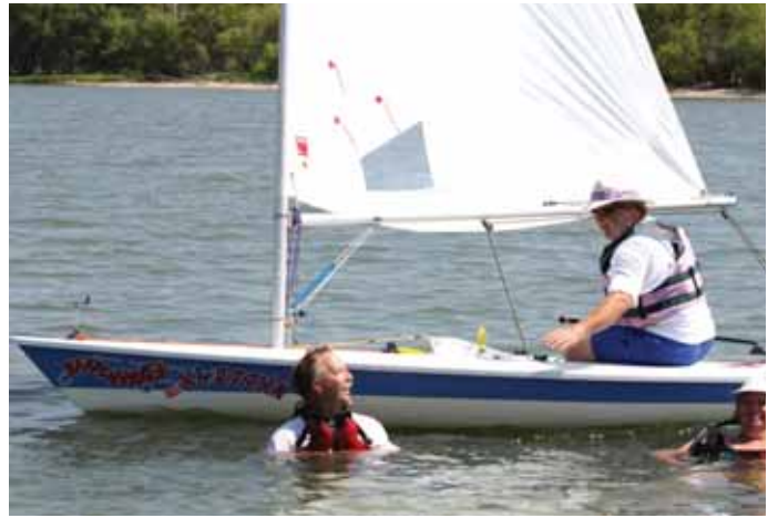
Photo Day and Cardboard Boat Day