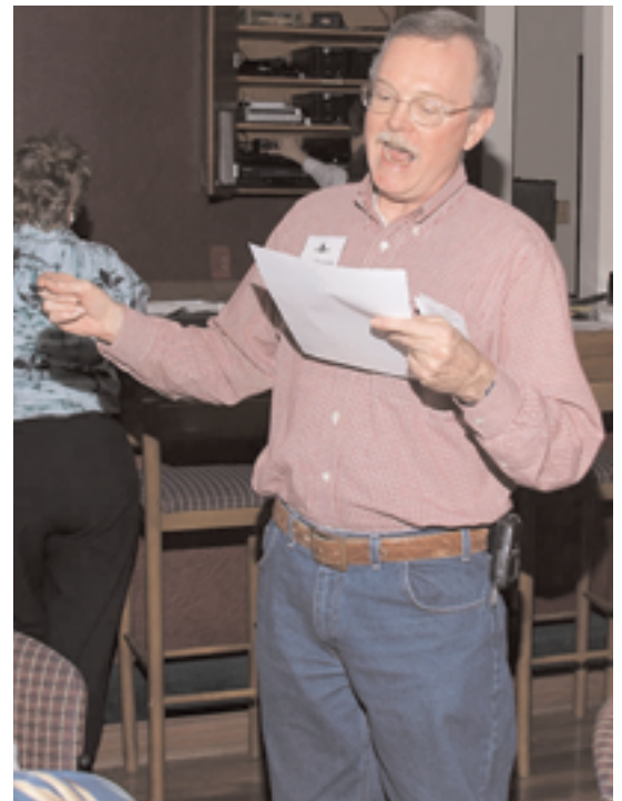
Dude, take it to the shower.