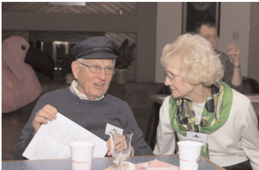
It's the Captain and Tenille.