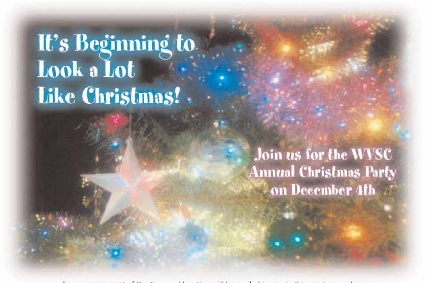
An announcement of the time and location will be mailed to you in the coming weeks

Congratulations to the winners and thank you to all who participated and/or volunteered in any way. The full final results are posted on the web site. Participation awards will be presented at the annual meeting. Please let a member of the racing activities committee know of any suggestions for next year.