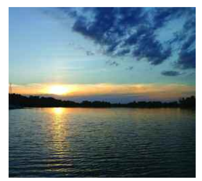
A Walnut Valley Sunset

We have had a fairly good season with the weather cooperating for some of the race days. We also had a bonus of four successful long-distance races. Please feel free to give me or anyone on the racing activities committee any feedback on what you think did or did not work well or any suggestions for next year. We will be sure to pass any comments on to next year's committee. I will post the final results for the Fall session and the full-year results in next month's Windword. Thanks to all the volunteers and faithful participants for another successful racing season!