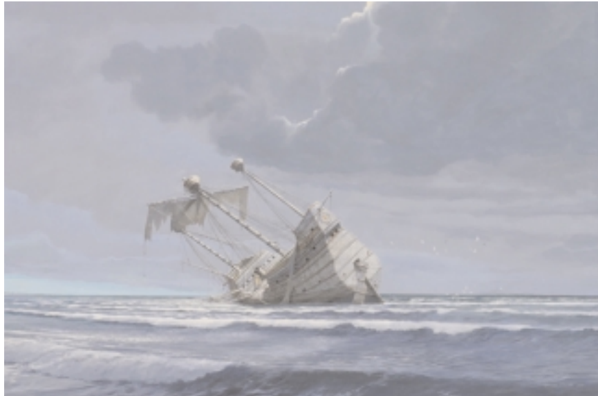
Wreck of the SAN FELIPE on Baja California coast.