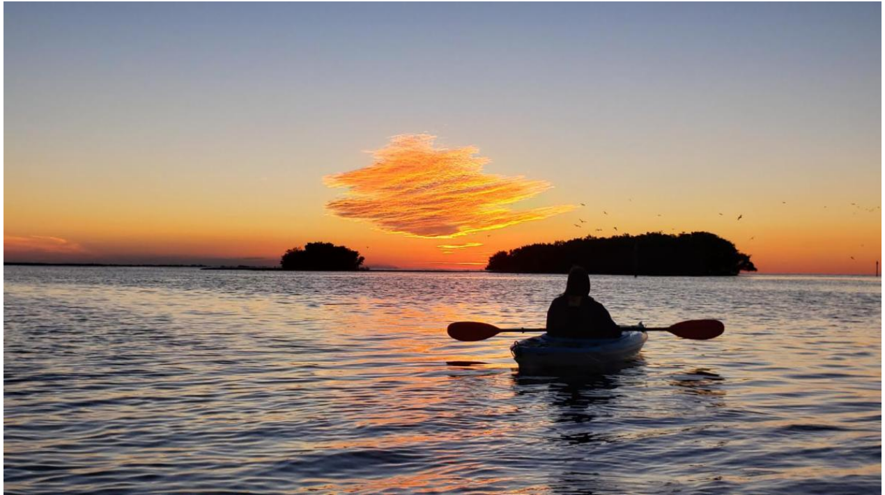
Cheryl Wertheimer working on her downwind technique at sunset...somewhere in the Florida Keys.

With a purpose...Hey, nobody said "YOU" had to do it. But if the idea floats your boat in some strange and semi-sadistic way, get a crew together, get a boat, a coffee pot and maybe a six pack of Red Bull and let's put together a game plan... Note: the 24 hours on the water event is a sure bet. It's going to happen. Our stated purpose... we're working on it. These things take time. Relax and maybe try staying up the ten O' Clock new tonight. You can do it.