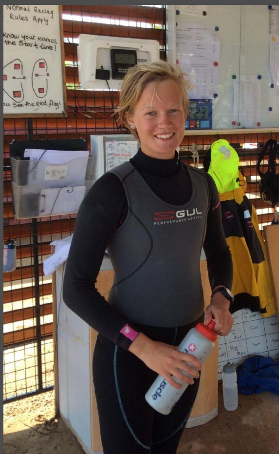
Menorca Sailing; Mahon Harbor, Menorca Spain