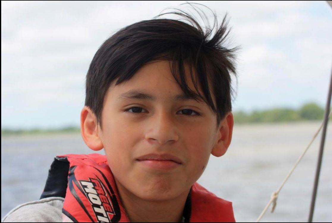
Future Olympic RS 200 Sailor!