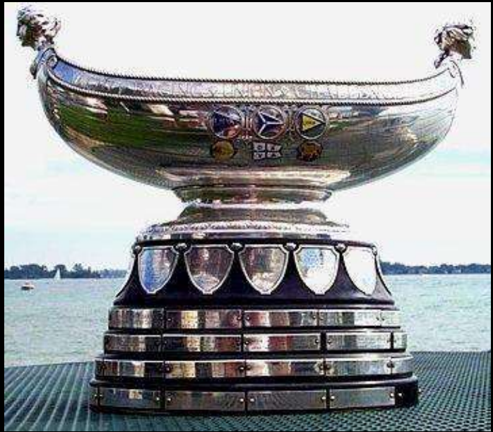
Walnut Valley Sailing Club Catalina 22 - Two Thousand Twenty Three Championship Trophy