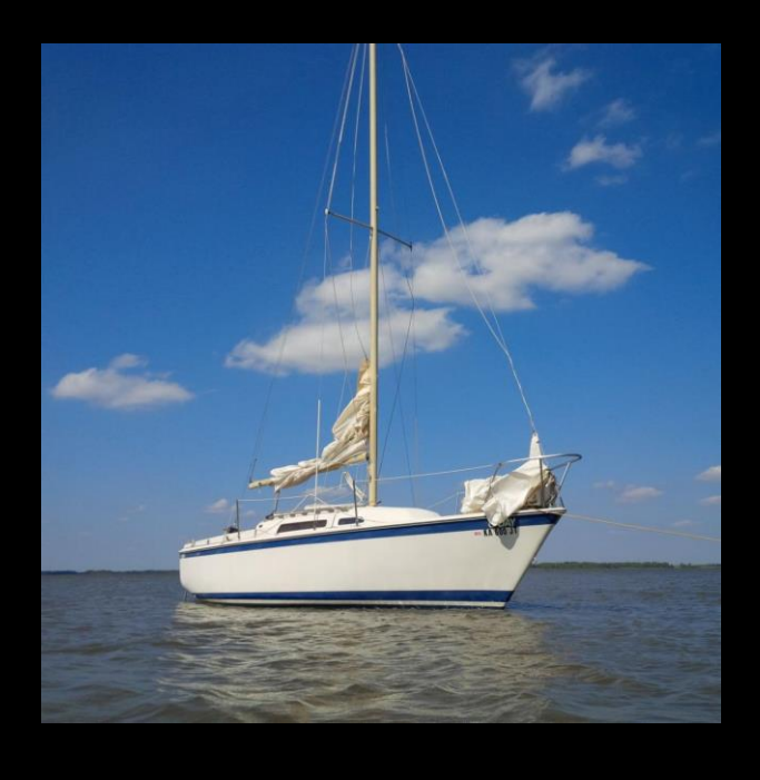
Boats & Gear For Sale