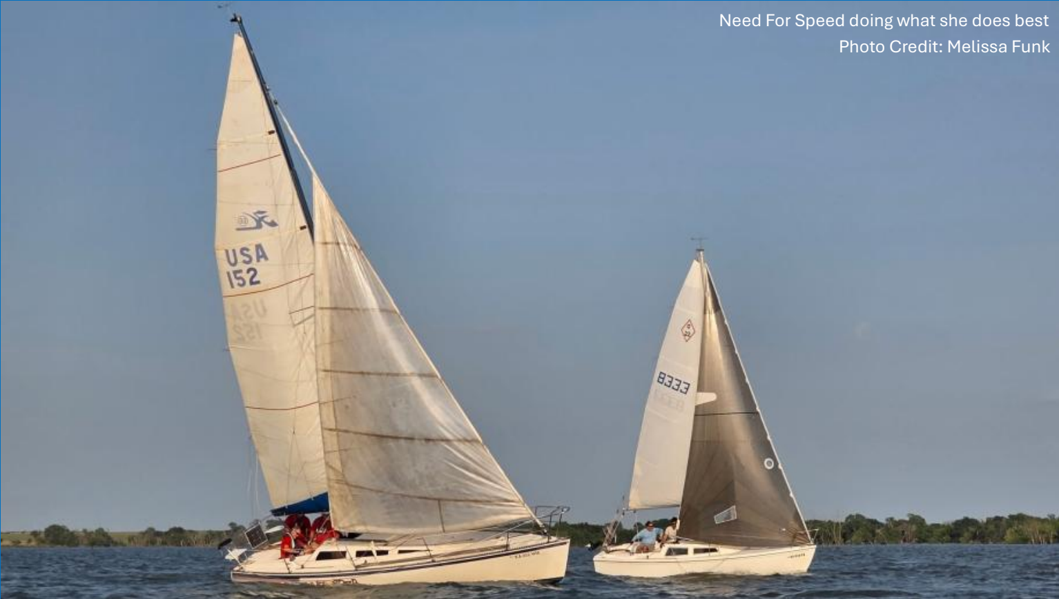
Need For Speed doing what she does best