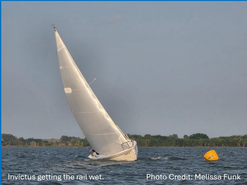
Invictus getting the rail wet.

There are now only 5 Wednesday night races left in the season and competition at the front of the fleet is tight! Mother nature has blessed us with steady winds and tolerable temperatures most of the season but the dog days of summer are still ahead so pack a cooler with cold beverages and come on out. The most exciting racing action really does take place at 5kts on a little lake in Kansas!