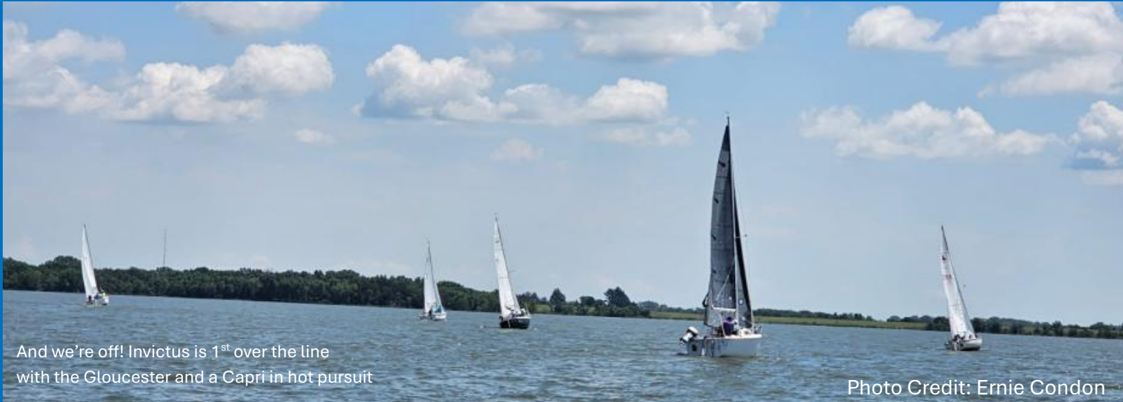
And we're off! Invictus is 1 st over the line with the Gloucester and a Capri in hot pursuit